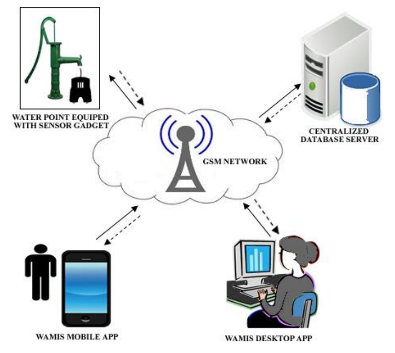
Figure 1: Proposed system architecture

As depicted in Fig. 1, the system is composed of four fundamental components; Water point (WP), Centralized Database Server (CDS), WAMIS Desktop App and WAMIS Mobile App. In the system setting, GSM Network is the heart of the system with the sole responsibility to interconnect the aforementioned four components. GSM Network has extended very rapid and provides a reliable means of connectivity. Mobile phone network GSM, GPRS data connectivity provide a viable national wide and cost effective mode of connecting through the internet to any server and this is an option that need to be actively explored [10].